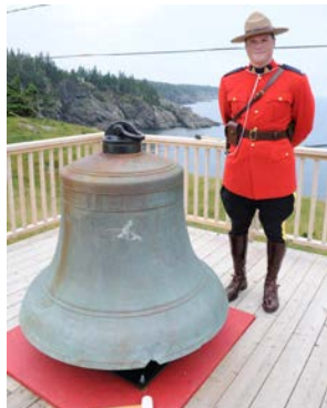
RCMP officer with fog bell